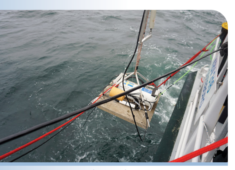
Launch of the Swedish Svenga station for Jomopans

JOMOPANS presents its results regularly at international conferences, and will do so at the <u>2020</u> <u>Ocean Science Meeting</u> in San Diego, California, USA.