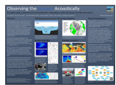
Community White Paper