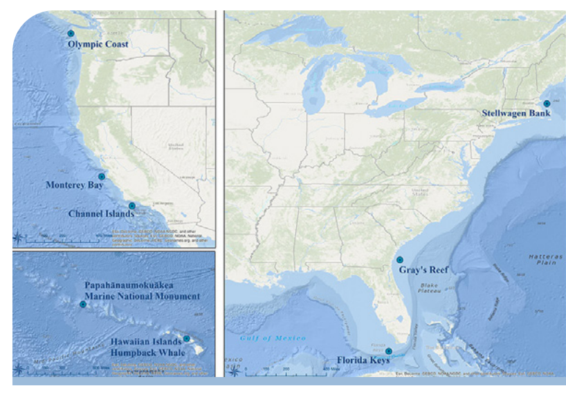
Locations of SanctSound observations (from <a href="https://sanctuaries.noaa.gov/science/monitoring/sound/">https://sanctuaries.noaa.gov/science/monitoring/sound/</a>)

SanctSound (https://sanctuaries.noaa.gov/science/ monitoring/sound/)—From Leila Hatch: "SanctSound is a multi-year effort, co-managed by the U.S. National Oceanic and Atmospheric Administration (NOAA) and the U.S. Navy, to monitor underwater sound within the U.S. National Marine Sanctuary System. In late 2018 to early 2019, recorders were placed at 28 of the project's 30 monitoring locations within seven national marine sanctuaries and one marine national monument. Twenty-six of these locations are serviced about 3 times/year, while 4 locations in the Papahānaumokuākea Marine National Monument are serviced annually. Additional data collection efforts are underway/planned for fall-winter 2019, including listening glider surveys in Gray's Reef and Stellwagen Bank National Marine Sanctuaries off the U.S. east coast, and in Papahānaumokuākea Marine National Monument in the Pacific Ocean. Several sites are integrating recording efforts with telemetry infrastructure, and supplementary tagging of soniferous species as well as receiver maintenance was underway in summer-fall 2019. The first six months of