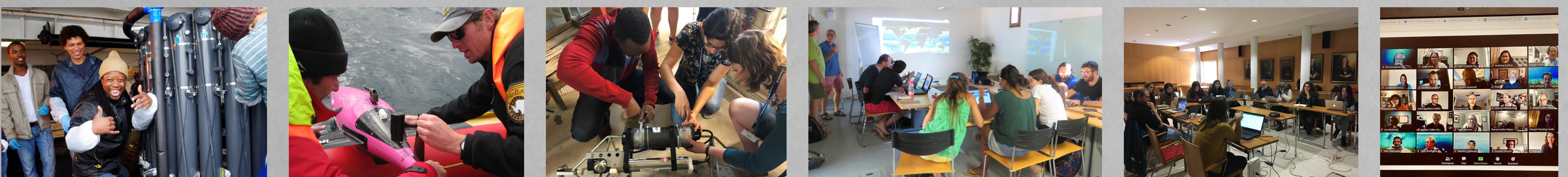
From left to right: (1) Getting ready to deploy a GO-FLO-CTD for trace metal sampling in the Southern Ocean, onboard SA Agulhas II, (2) Glider deployment from South African vessel Agulhas II in the Southern Ocean, (3) IOCCP 2019 Training Course in Kristineberg, Sweden, (4) SOLAS Summer School 2018 in Corsica, France, (5) Working Group 159 (DeepSeaDecade) discussing a roadmap for a standardised global approach to deep-sea biology for the Decade of Ocean Science for Sustainable Development at their first meeting at the University of Aveiro, Portugal, (6) Virtual meeting of Working Group 158 (C-GRASS) aimed to complete a scientific synthesis of the drivers and trajectories of seagrass ecosystems under global change, and to provide a framework for future coordinated observation and research on seagrass systems