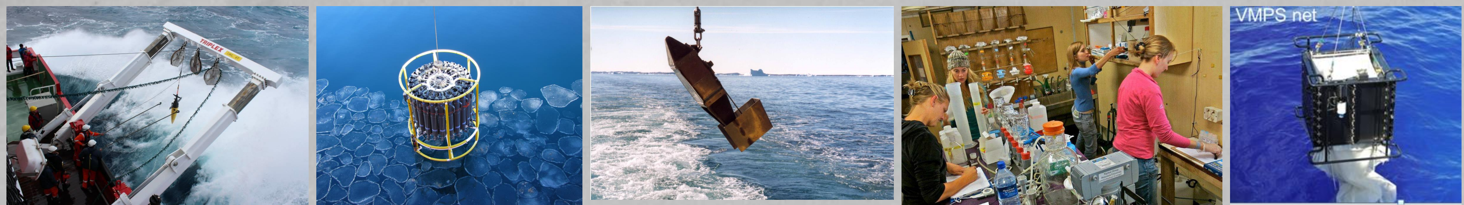
From left to right: (1) Sea-glider deployment from South African Agulhas II on voyage to the Southern Ocean; (2) Deployment of CTD Rosette System from South African vessel Agulhas in the Southern Ocean; (3) Retrieving the Continuous Plankton Recorder (CPR) from the Aurora Australis in Eastern Antarctica; (4) The Southern Ocean Carbon and Climate Observatory (SOCCO) scientists at work; (5) Vertical Multiple-opening Plankton Sampler (VMPS) collecting plankton for metabarcoding up to 1000 m depth for Working Group 157 MetaZooGene.