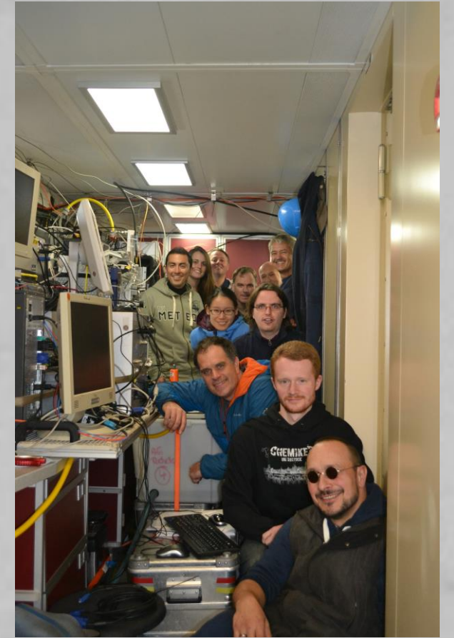
Lab work on board R/V Elisabeth Mann-Borghese