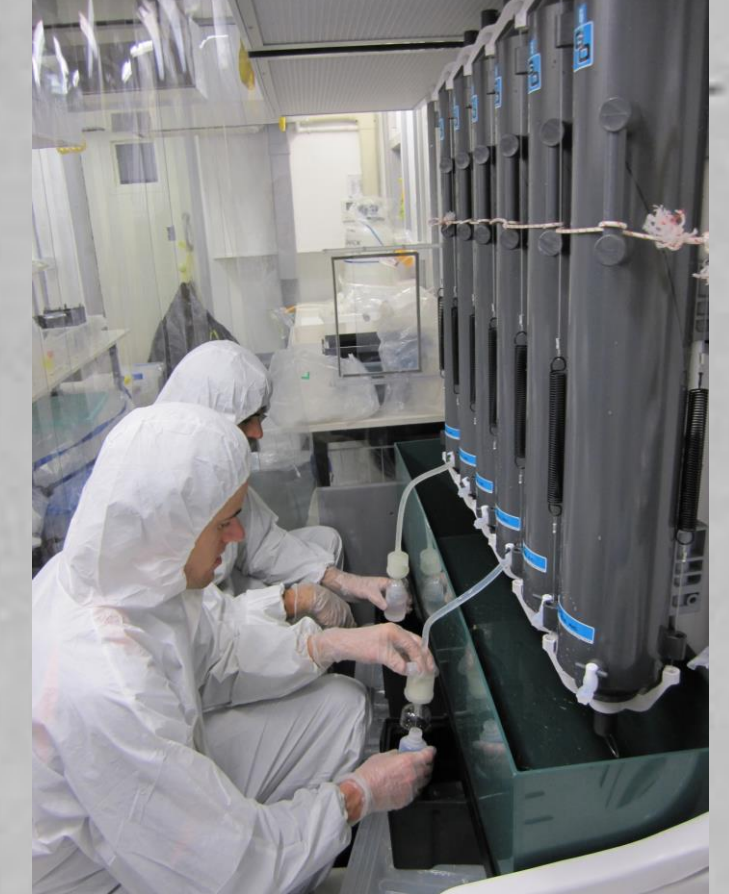
Clean container laboratory on board GEOTRACES cruise GP13