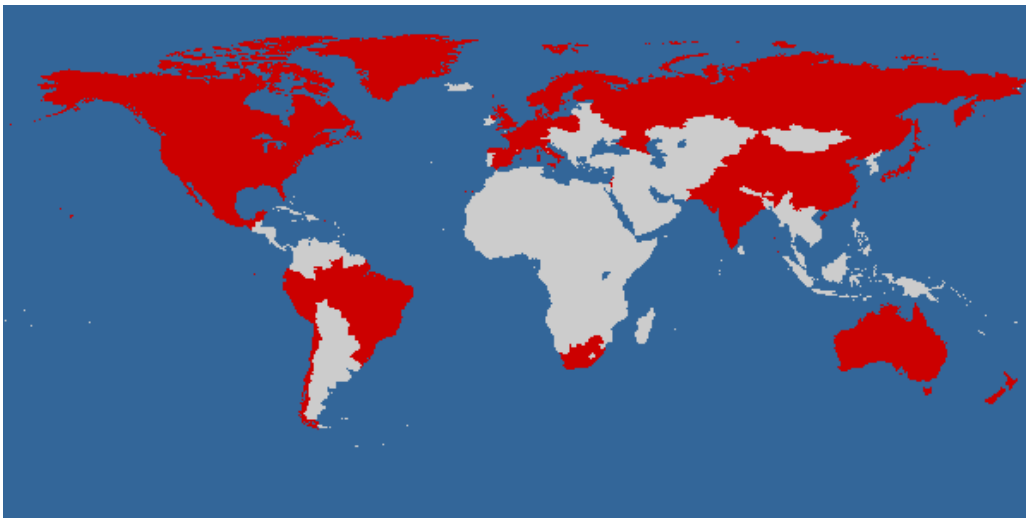
Map generated from http://www.world66.com/myworld66/visitedCountries .