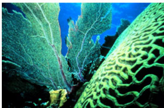
Caption: Brain coral and sea fan close-up.

Presentation and discussion of group results in plenary; synthesis; strategy for publishing, and planning of follow-up activities and a second workshop in 2007.