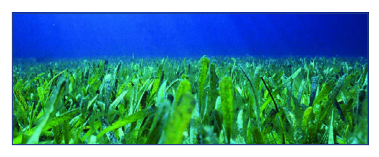
Seagrass in Florida Keys National Marine Sanctuary, National Oceanic and Atmospheric Administration (https://floridakeys.noaa.gov/plants/seagrass.html)

This group will produce a scientific synthesis of the status and trends in global seagrasses and the systems they support, including seagrass occurrence, ecosystem characteristics, and benefits to human well-being. They will produce a handbook of standard protocols and best practices for collecting, curating, and sharing data on seagrass ecosystems, and will contribute this information to the Ocean Data Standards and Best Practices Project of the International Oceanographic Data and Information Exchange (IODE) of IOC. The group will promote development